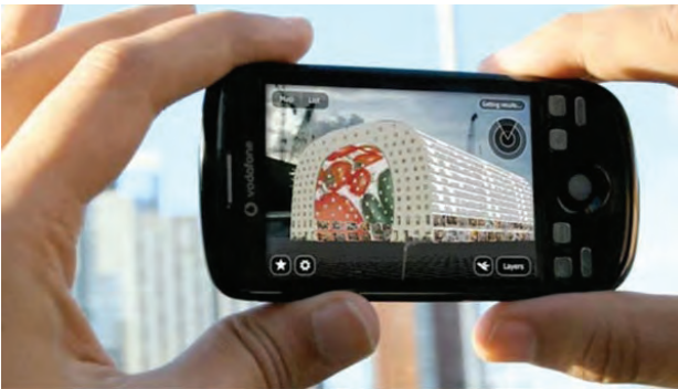
Figure 4: AR apps show current and future development.

The Garden Street Terraces project could have gained more support from the community with the use of these or similar technologies. The community could have understood the size of the proposed buildings and had a greater understanding of scale and feel. This powerful communication tool has the ability to strengthen the rapport between developer and community.