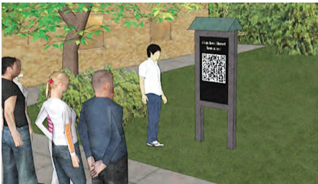
Figure 3: A kiosk with a QR code.

An outreach process that involves posting a QR code at an on-site kiosk, as seen in Figure 3, or spreading these codes throughout a target, are great examples of ways to reach the stakeholders in the area who are most effected. Website visits are trackable through free websites such as BeeTagg, where it is possible to see how often codes are being read or even generate demographic information from those who visit the area by linking the QR Code to a quick survey. The application of this idea is simple and cost effective, which could establish this outreach strategy as extremely valuable in further engaging the community in the Garden Street Terraces project.