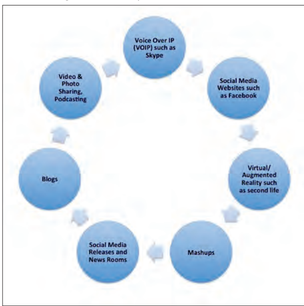
Figure 1: Commonly known web tools.

The planning process is steeped in the political process because planners in a democratic society attempt to balance the interest of many different constituencies. In order to understand the need for public participation through new technologies, it is important to look at planning's history of civic engagement. The planning field was previously dominated by rational theories and technical experts, who were proponents of limited civic engagement. Starting in the 1960s planners began to see themselves as facilitators of the citizen view, playing more of a supportive role (Manadarano et al., 2010). This led to dramatic changes in planning practices making public