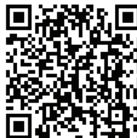
Figure 2: GST generated QR code.

QR Codes are a way to connect printed content with online content. In that sense, an outreach process would be able to use this technique to make information on the Garden Street Terraces project available at the moment of need. For instance, a QR Code can be posted to provide a map when it is important to give visitors directions without making photocopies. Infor-